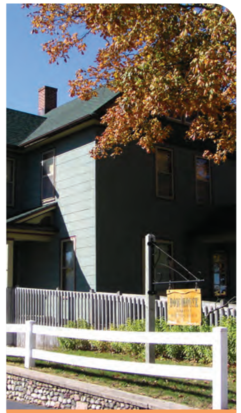
Through a grant from an affiliate fund, the Iowa Falls Historical Society was able to re-roof the Dow House.

Since the inception of the program in 2005, Iowa C.A.N. members have generated over $15.3 million in charitable gifts and granted over $6.1 million to charitable organizations within their local communities.