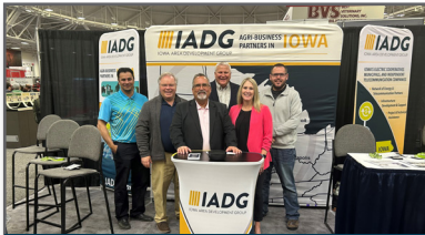
PEAK 2024 - Minneapolis

The IADG staff and partners are making impactful connections while promoting Iowa at trade shows across the nation. Here is a sample of events attended over the past quarter.