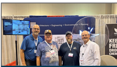
AAMP - Omaha

IFT FIRST – Chicago, IL – Institute of Food Technologists FIRST (Food Improved by Research, Science, and Technology) focuses on innovative solutions for the future of food.