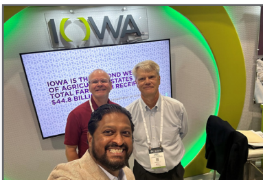
IFT FIRST - Chicago

2024 ADPI/ABI Annual Conference - Chicago, IL - ADPI/ABI focuses on dairy ingredients and related products. American Dairy Products Institute and American Butter Institute.